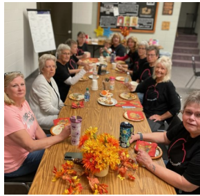
Our Thursday morning quilters having coffee