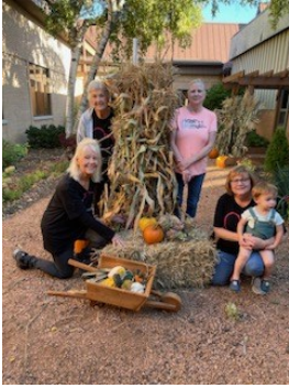
Our Courtyard Crew decorating for Fall