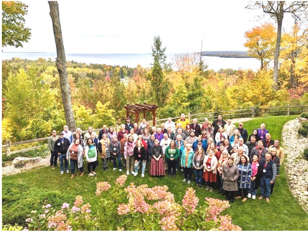
Rostered Leaders joined together in Door County for Fall Theological Conference.