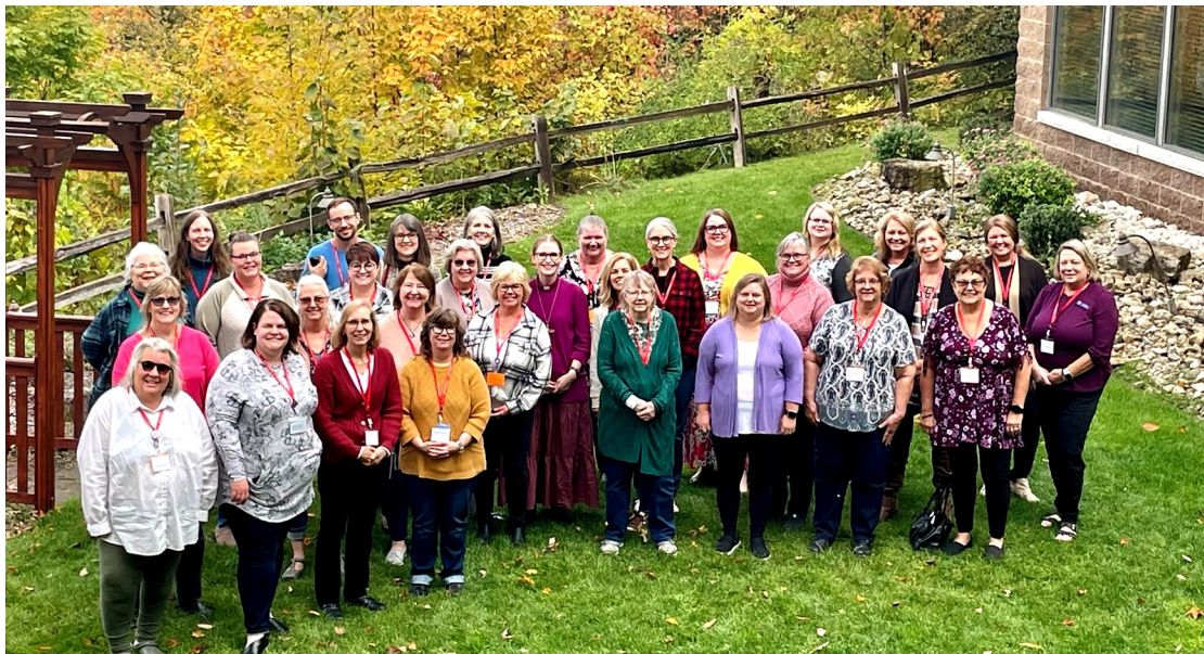
ad+ministers gathered together in Door County.