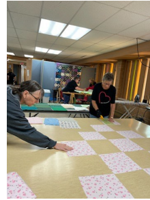
Our Thursday morning quilters working hard